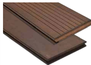
V-Groove / Brushed (reversible)